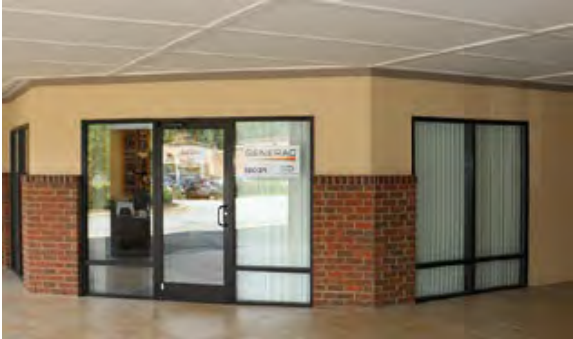
Suite 110 Store Front