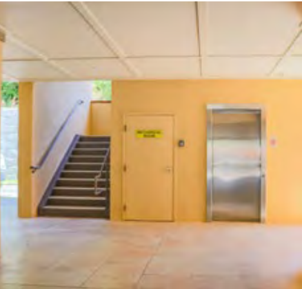
Stairs and elevator